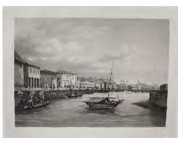
Voyage autour du Monde par les Mers de l'Inde et de Chine exécuté sur la Corvette de l'État La Favorite pendant les Années 1830, 1831 et 1832 Paris, 1833-35

This is the first edition of a significant French circumnavigation from 1830 – 1832 led by Cyrille Pierre Théodore Laplace (1793 – 1875), a French navigator and naval officer. The mission was to re-establish French influence in Indo-China in the midst of rivalry among European powers, gather trade and military information, and conduct hydrographic surveys and natural history studies. The voyage included a stopover at Singapore in August 1830 and the account describes the bustling port, multi-ethnic population and town layout of Singapore.