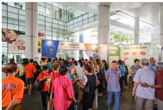
Members of the public and publishers at the event