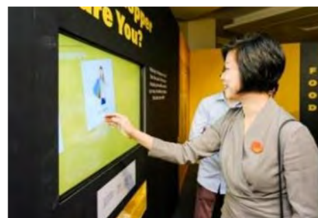
Opening ceremony of the “Selling Dreams: Early Advertising in Singapore” exhibition