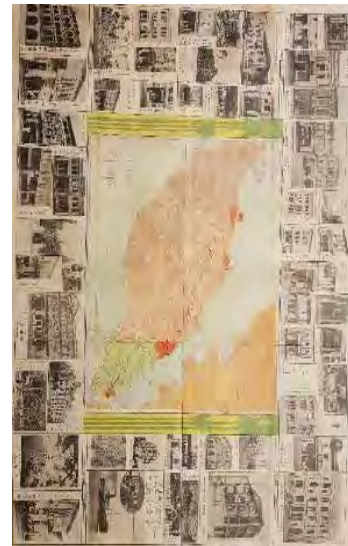
馬來半島案内 (Marai hantō annai)