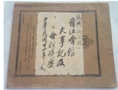
Record of Major Events & Synopses of Affairs and Minutes of Meetings

Founded in 1918, the Singapore Chin Kang Huay Kuan donated 633 heritage materials containing meeting minutes, correspondence, immigration papers, personal identification documents as well as documents relating to the Chin Kang School. These materials help to enhance the understanding of the Chinese diaspora and the role of Chinese clan associations in the welfare, education and cultural development of the Chinese community in Singapore's early years.