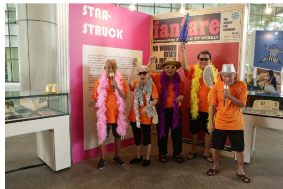
Elderly guests from nearby communities having fun at the "Instagram-worthy" photo booth