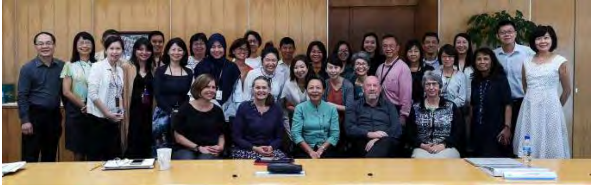
Participants at the peer review