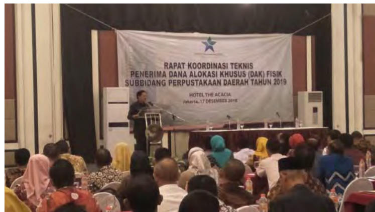
National Coordination Meeting on Library Special Allocation Budget

Since last year NLI tries to advocate the libraries in the local authorities in Indonesia. We propose a special budget for library as the consequences of our Local Government Act that stated that Library is a mandatory public service in every local authority in Indonesia. This Year the Indonesian Government will spend US$20 million for Library Special Allocation Budget. The Budget will be used to build library buildings, library furniture, IT infrastructure and library collections.