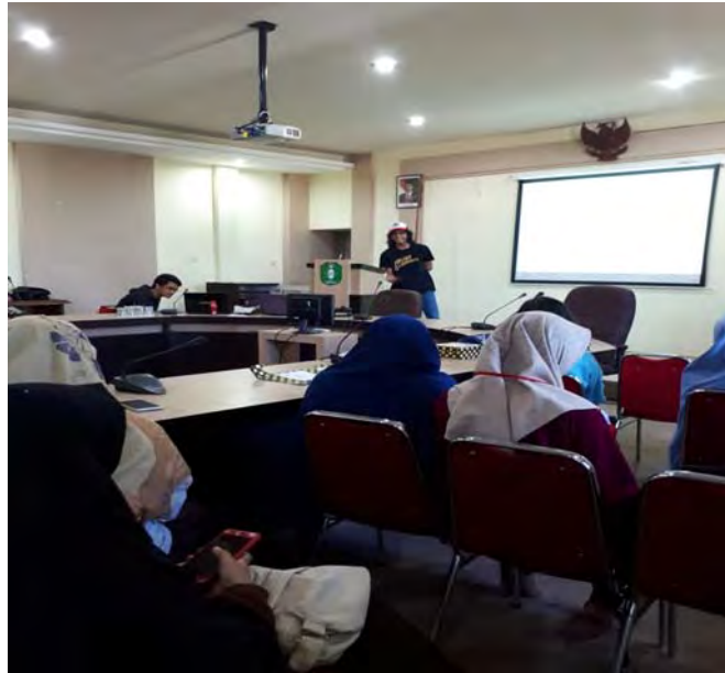
Vlog Training in West Borneo Public Libraries