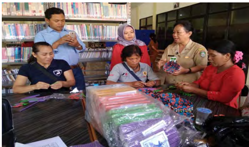
Creating handicraft in public libraries