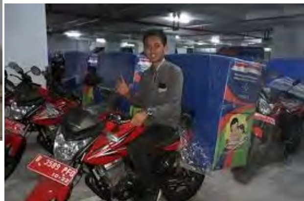
Mobile Libraries and Motorcycle Mobile Libraries