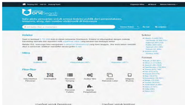
Indonesia OneSearch homepage

NLI initiated a programme called Indonesia OneSearch (IOS) that aims at providing a national repository portal. The idea of IOS is that the portal provides interoperability between different metadata and library systems used by libraries in Indonesia and it is easy for users to use and access. Started in 2015, the NLI has been collaborating with partner institutions and libraries, most of which are special and academic libraries that continue to grow in numbers to build up the database from each library. By the time this report was prepared, NLI has successfully integrated databases from 1251 libraries and more than 5205 repositories from all over Indonesia. The portal can be accessed via http://onesearch.id . Currently it has more than 5,354,203 million bibliographic records. Starting in 2017, the second phase of the program has seen the focus on the analysis of full-text contents provided by the member repositories through open access. These contents are to be analyzed by using the Natural Language Processing (NLP) technology. This approach will allow users to make a search through our metadata, to access the full-texts, and to explore the knowledge and information via the knowledge explorer.