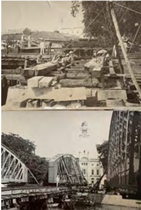
Photographs of Anderson Bridge under construction (1908 – 1910)