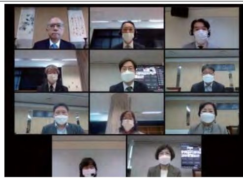
National Library of Korea-National Diet Library of Japan Online Work Exchange