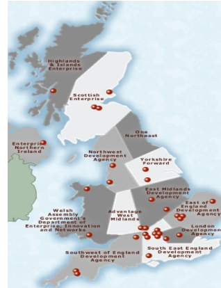
Map of development agencies