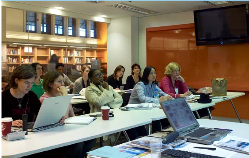
Image of the an Business & IP Centre Workshop Room