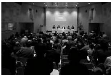
Symposium commemorating the 60th anniversary of the NDL

For the maintenance and improvement of facilities, the second stage of maintenance and repair work was started in the Annex of the Tokyo Main Library. A second building site for the Kansai-kan was acquired, and a geographical survey was carried out.