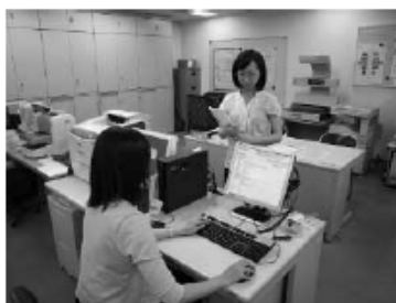
Service for the staff of branch libraries (image)

To promote the service by the branch libraries, a survey on users’ needs was conducted for administrative and judicial staff based on the Action Plan for Supporting Branch Libraries placed in the Executive Agencies of the Government and in the Judicial Agency. Special training was also conducted to support the digitization of the materials in branch libraries.