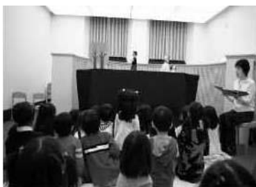
Spring event for children

Based mainly on the Basic Expansion Plan for the International Library of Children's Literature formulated in 2006, an outline expansion and repair plan for the ILCL was finalized in December 2007. Based on this outline, we conducted necessary examination and operations for the facility design in this fiscal year.