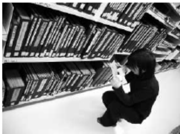
Checking sticky trap for insect

stage plan of transferring materials from the Tokyo Main Library to the Kansai-kan to be implemented in FY2009 was drawn up based on the stack plan of the Tokyo Main Library and the Kansai-kan formulated in FY2006.