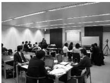
Training program on reference service

To advance domestic cooperation activities, conferences and meetings with public libraries and university libraries and training sessions for the staff of local assembly libraries were held. The NDL supported the 94th All Japan Library Conference (in Hyogo) and co-hosted the 2008 Annual Meeting of the Japan Special Libraries Association (in Kyoto) with the Japan Special Libraries Association.