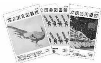
Renewed National Diet Library Monthly Bulletin

The number of permanent staff in FY2008, including the Librarian of the NDL and Deputy Librarian, was 908, a decrease of 15 from FY2007.