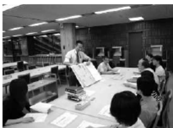
Research instruction sessions for visitors (image)

Services intended for the general public are provided in the Tokyo Main Library, the Kansai-kan, the International Library of Children's Literature, and the Toyo Bunko (Oriental Library), branch of the NDL. These services consist of both remote and in-house services.