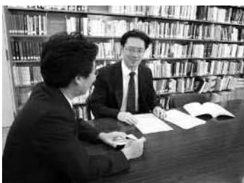
Briefing a Diet Member's secretary (image)

The provision of services to the Diet is the primary duty of the NDL, and has been carried out under the across-the-library framework, led by the Research and Legislative Reference Bureau.